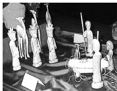
One of the nativities to be seen at “No Room at the Inn.”

Once again this year, residents of Ventura County have an opportunity to view hundreds of nativities from private collections in one place. The proceeds from the display will again benefit shelter programs in Ventura County. Project Understanding has been one of the recipients of these funds for a number of years.